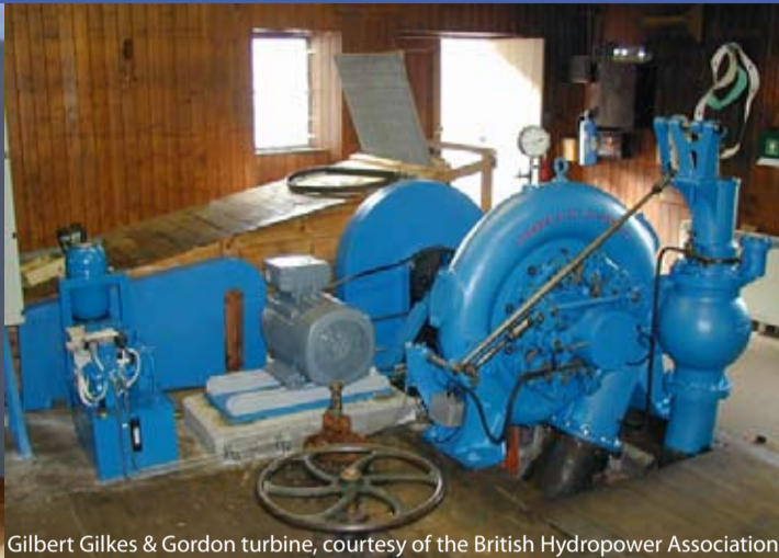
Gilbert Gilkes & Gordon turbine