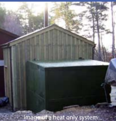
Image of a heat only system

As solar PV, but in addition, panels require between 2-4m 2 of roof space, and a hot water cylinder may be required. The existing hot water system should also be checked for compatibility.