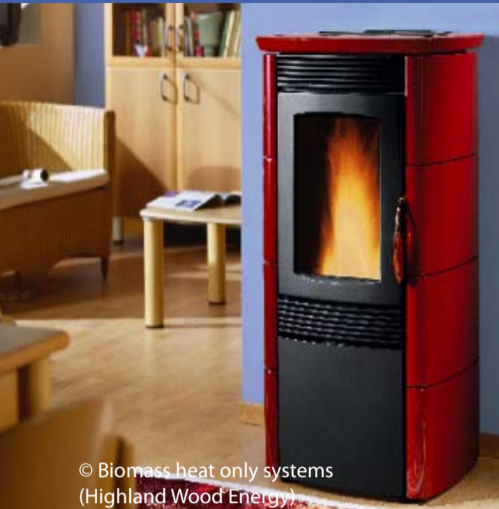
© Biomass heat only systems (Highland Wood Energy)

It is very important to consider at an early stage whether or not your property is suitable for your preferred micro-renewable energy technology. The following lists some of the main requirements for the most popular micro-renewable energy technologies currently available: